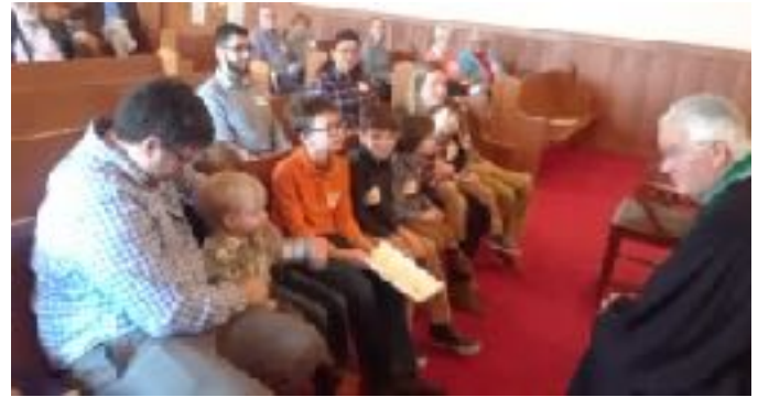
Children's Church Group filling a pew.