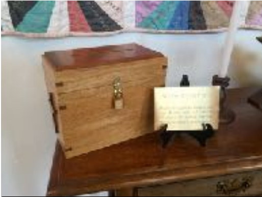
Stone Soup Suggestion Box