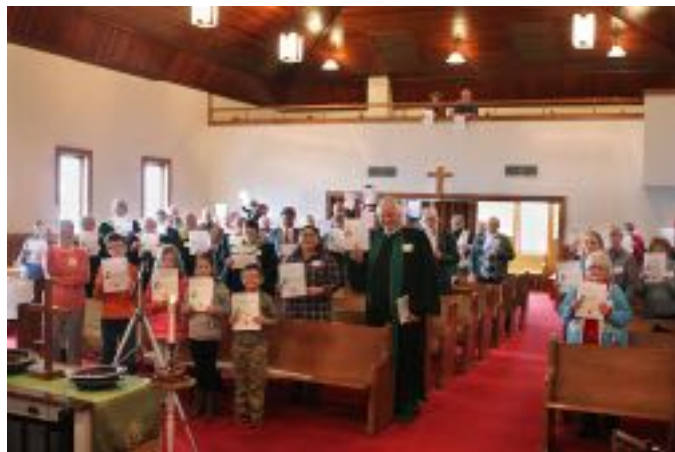
Matthew 25 Church Celebration.

Children are the future of our church. We are proud of our full team of Acolytes who serve every Sunday; we are proud of those who attend Church School; we are proud of those who part of Children's Church; and we are always proud of the ones who are part of our Children's Moments. It is good to fill a pew every Sunday with the smiling faces of the children of our church. They have an excitement that needs to be caught by us all.